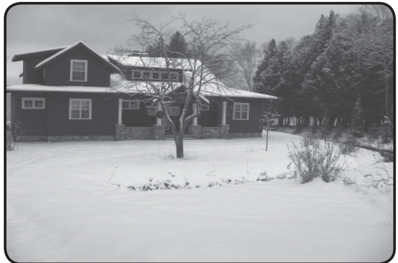
Mary and Paul Finnegan's vintage cottage style home and restored stream

The wetlands on the property were previously filled and the stream put underground. Reclamation of the stream and wetlands were done with DEQ permission, with consultation from Matt Heiman of the Leelanau Conservancy as well as the Milarch Brothers Nursery and Landscaping. Native aquatic plants were used in the stream restoration. Native grasses were allowed to grow and the property was hydroseeded with wildflowers. Some trees were planted around the perimeter of the property as well as native bushes. No phosphate fertilizer, pesticides or herbicides are used anywhere on the property. A natural lake-friendly shoreline and grounds protect water quality as well as enhancing the beauty of this vintage cottage style home.