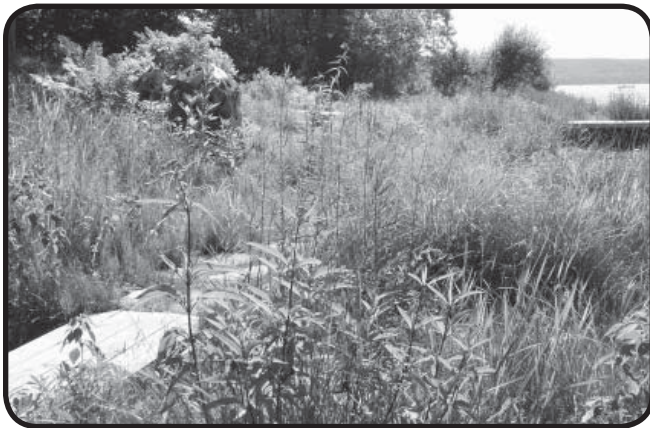
Susan's and Vik's wetland and shoreland restoration

Paths, sitting areas, a low profile deck and benches allow enjoyment of this beautifully restored area which has attracted a variety of wildlife. An unintended consequence of the entire project has been the emergence of large areas of the rare and endangered yellow Michigan monkey flower.