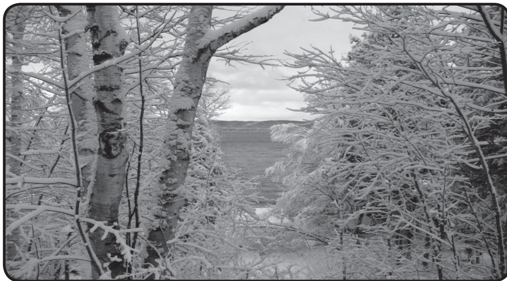
A heavy snow on January 11, 2008 after a day of temperatures in the upper forties.

Glen Lake: Yesterday, Today and Tomorrow