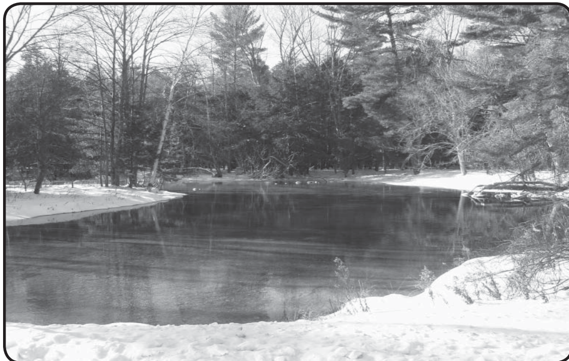
Our beautiful Crystal River - Winter 2008